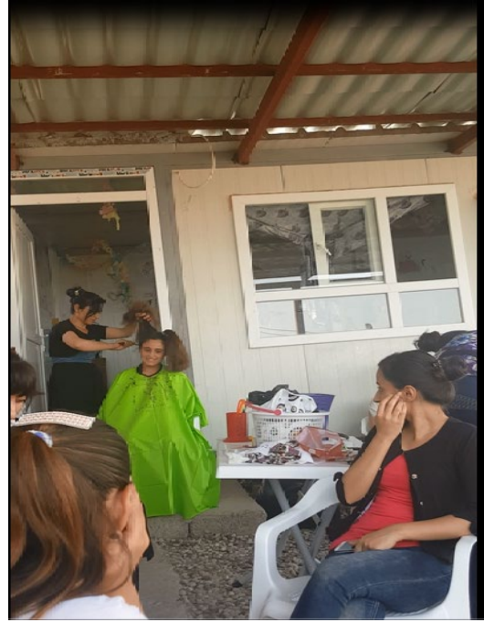
The ladies of Camp B'adraa during a Tuesday gathering in the beauty salon.