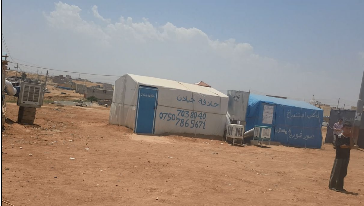
This picture taken in camp Be'adra shows how the community is being rebuilt in the aftermath of the 2014 genocide, with different services created by Yezidis to serve other members in the community. The white tent is a barber shop and the blue one next to it is a photographer and a copy center.