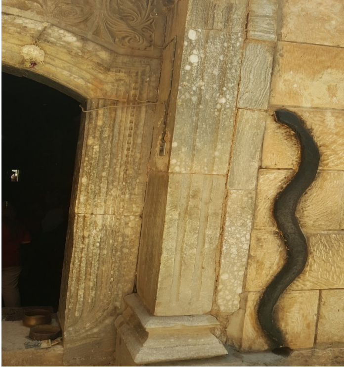
The black serpent, an important symbol of Yezidi faith found at the entrance of the temple.