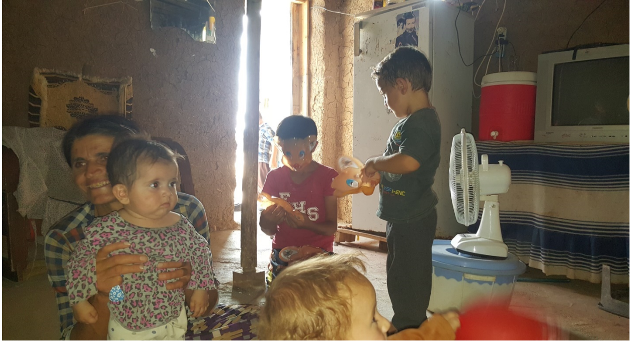
During a visit to a family in camp Khanki, the children were happy to receive some toys. None of the children had shoes to wear for two years.