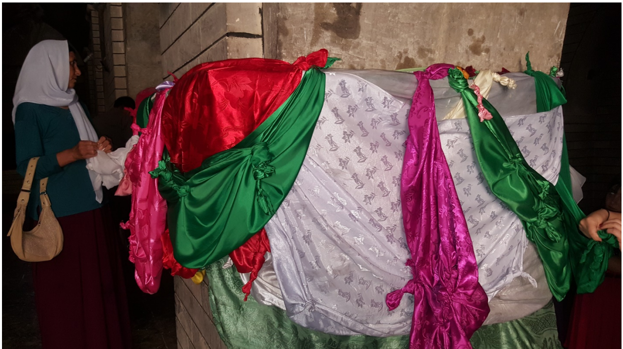
As part of the Yezidi prayer rituals, you have to untie those knots to have her prayer answered.