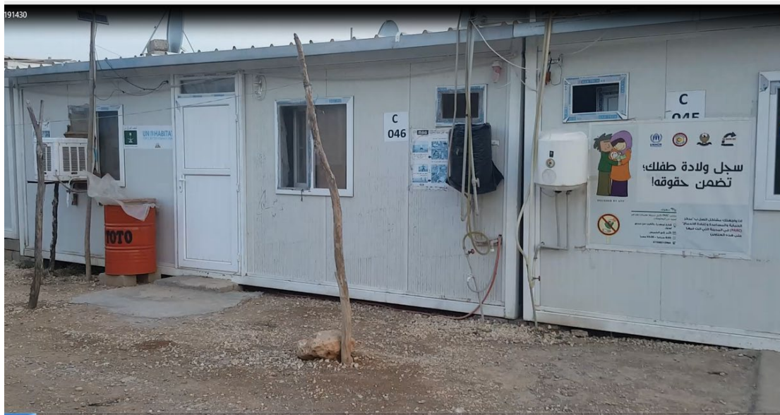
This picture taken in camp Shariah is UN property. The advert on the right calls for the registration of new born children to guarantee their rights.