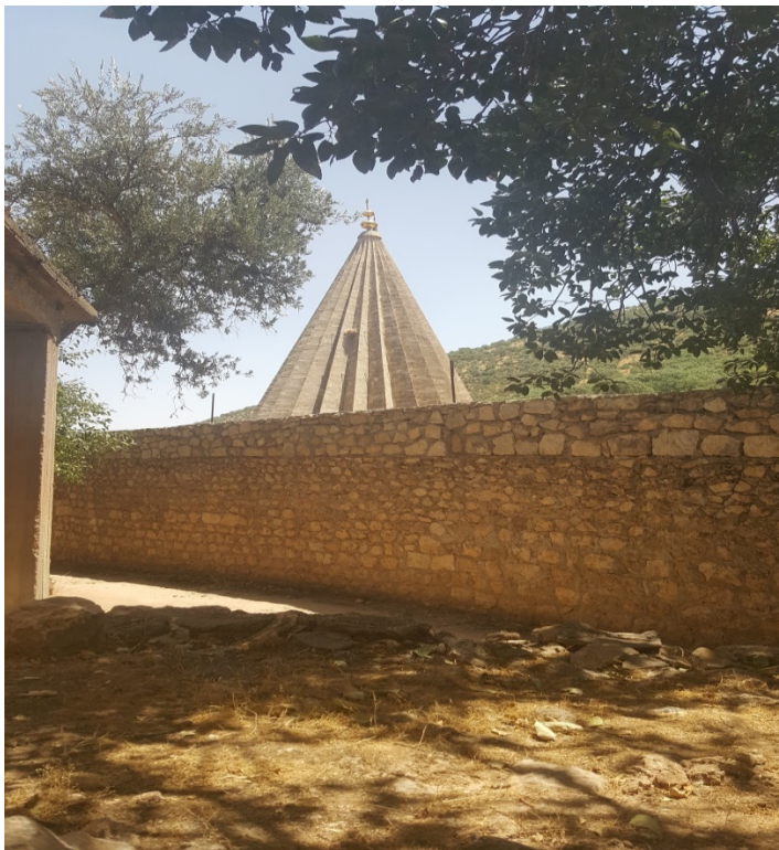
The holy city of Lalish is where the Yezidi temple is located

The use of symbolic resources and in this case pilgrimage to Lalish is significant in sustaining and helping individuals and communities experiencing chaos move through a transitional phase. In such situations when people lose the common ground, the taken for granted, they attempt to construct meaning through the use of symbolic elements: “that is, in shared concrete things, or some socially stabilized patterns of interaction or customs that encapsulate meanings or experiences for people (Zittoun et al, 2003).