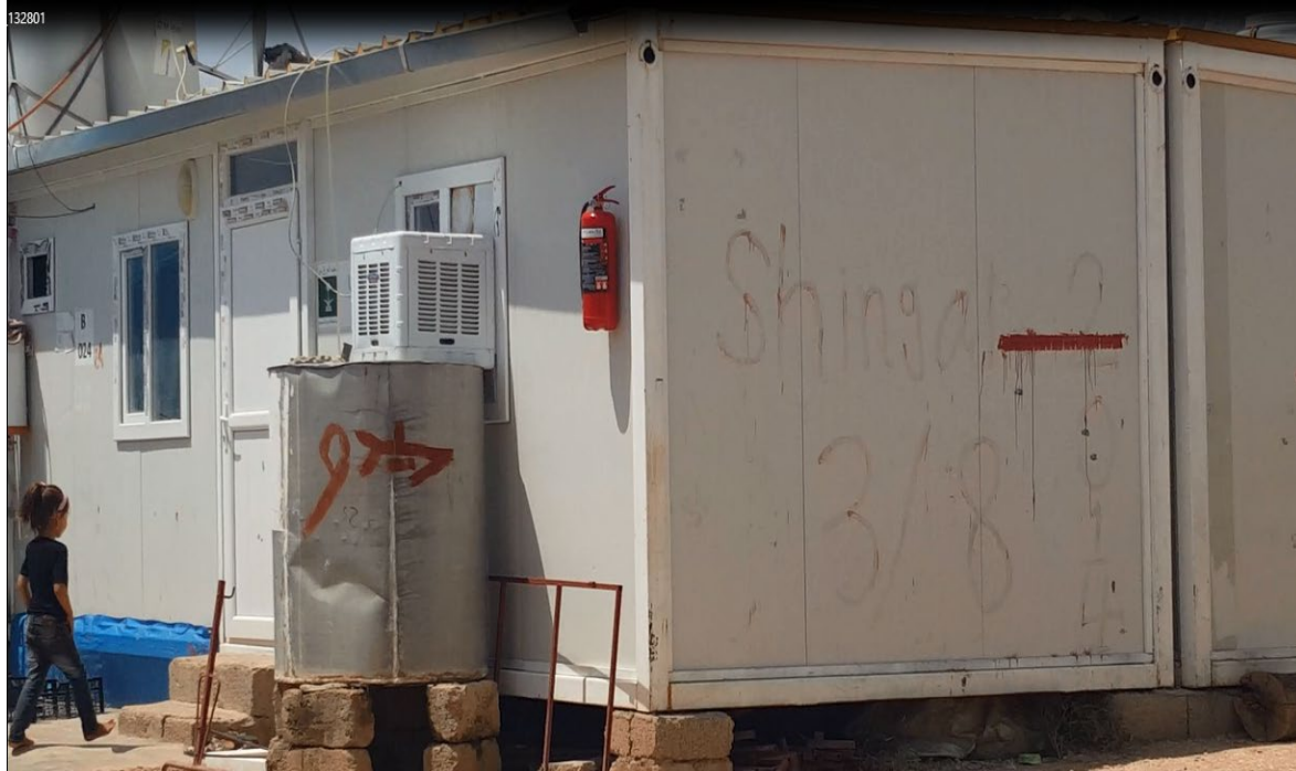
This picture was taken in Camp Shariah. This type of shelter is usually referred to as a “caravan” and is owned by the richer Yezidis. The right side of the shelter reads “Shingal- Sinjar 3/8/2014” – the date of the Siege of Sinjar.