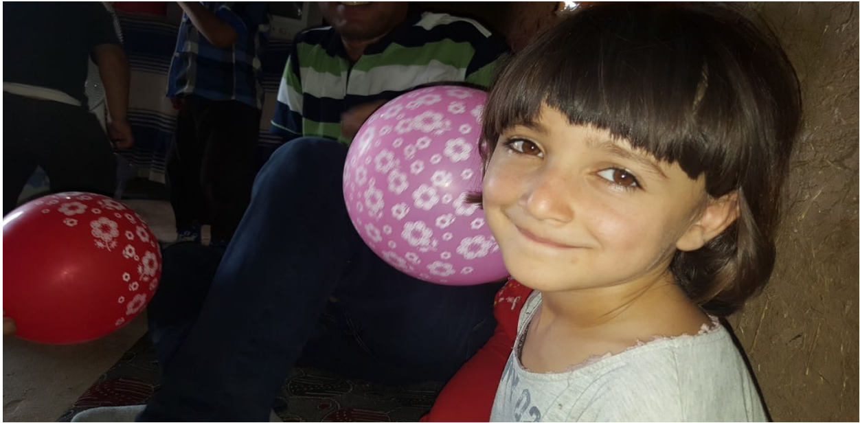
This young girl survived two weeks in the mountain with her mother. Her father was dead and her brother experienced a severe trauma that left him unable to communicate with anyone.