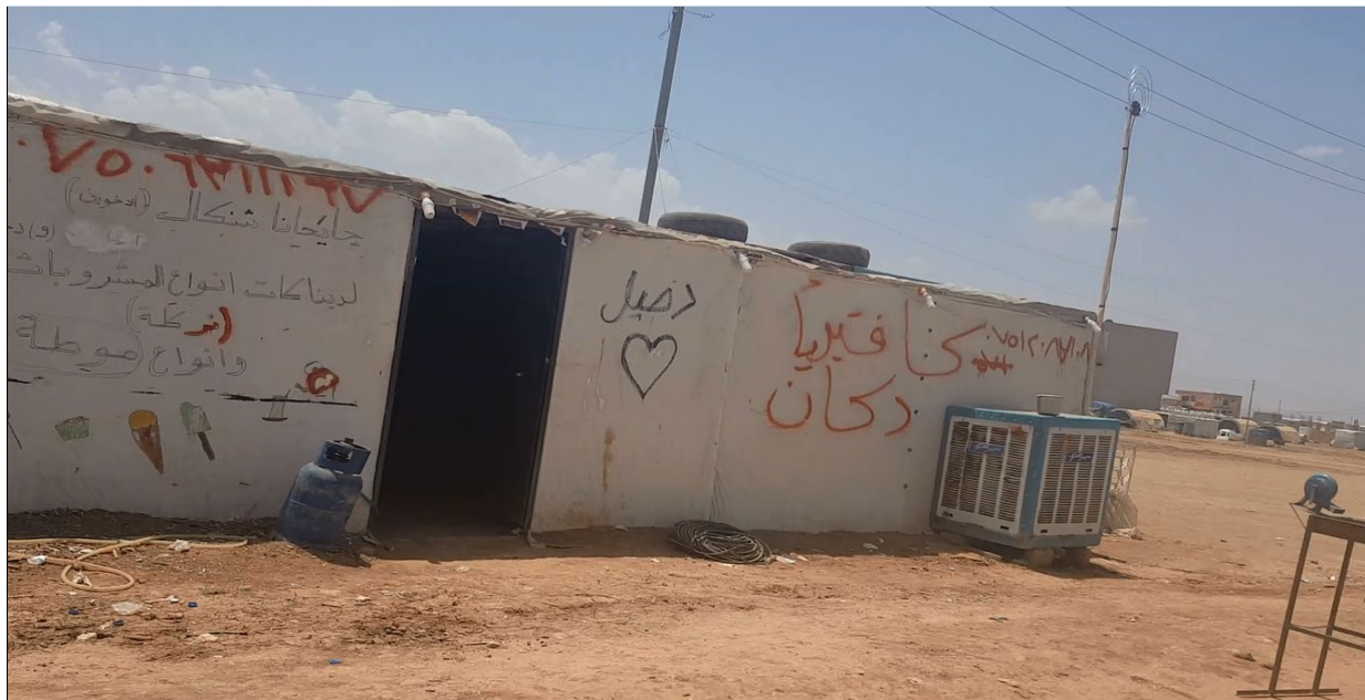
This is both a cafeteria and a grocery store inside one of the camps.