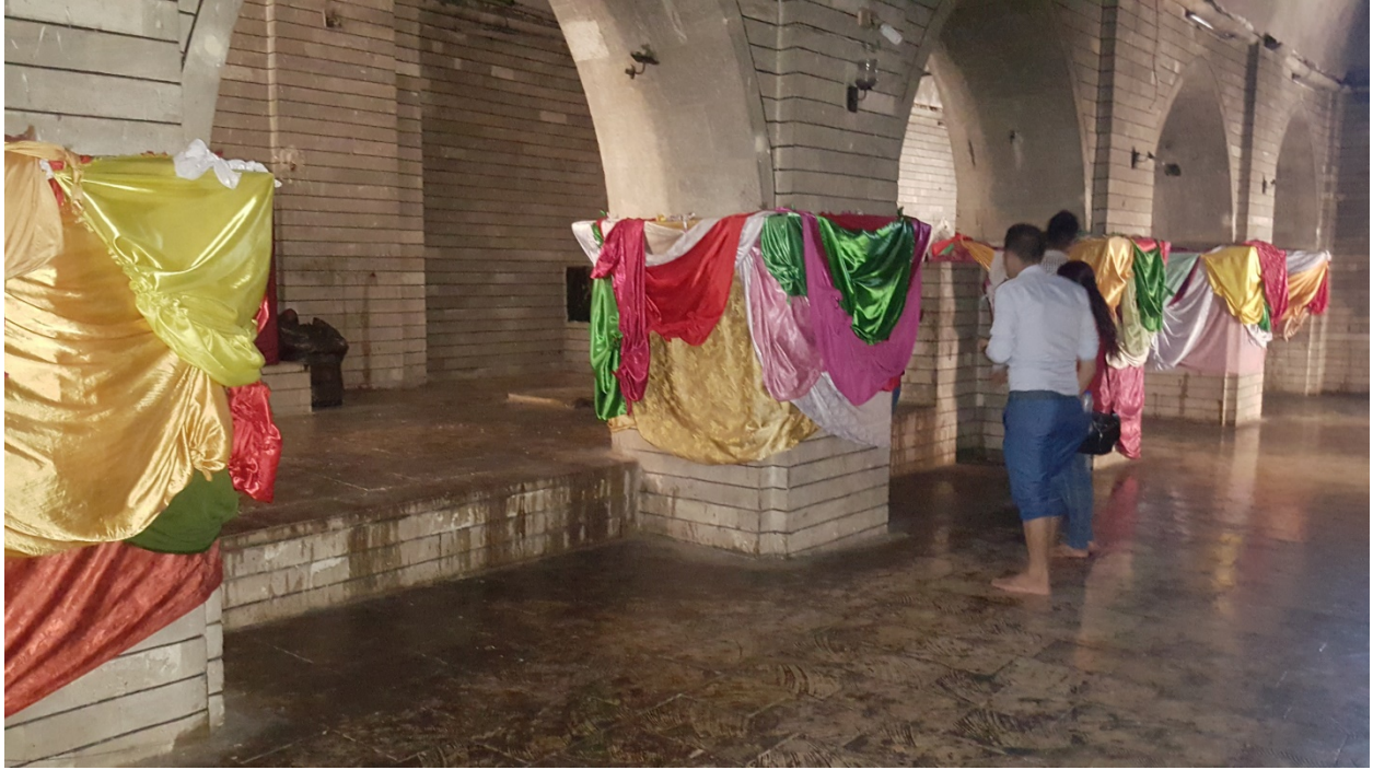
Inside the temple in Lalish.